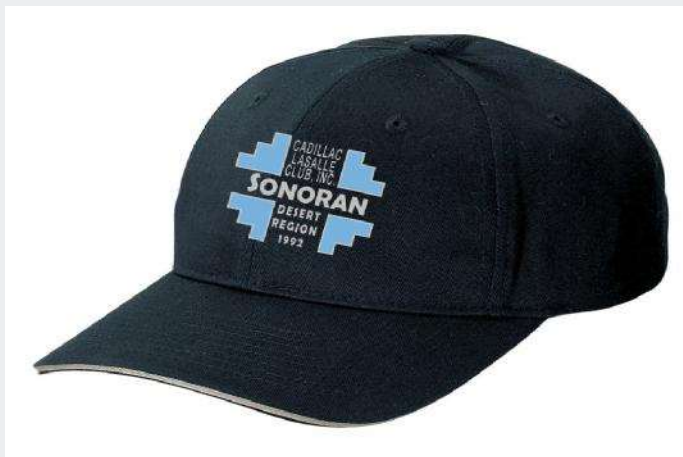
Cap CP85 100% Cotton Washed Twill sandwich bill cap. Color: Black