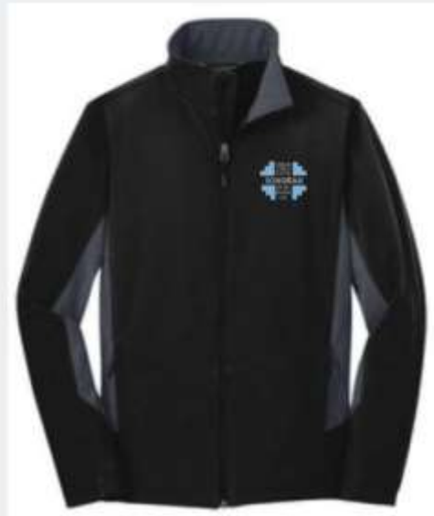
Jacket J318 L318