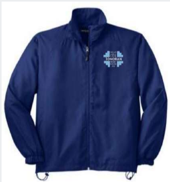
Full Zip Windbreaker Jacket