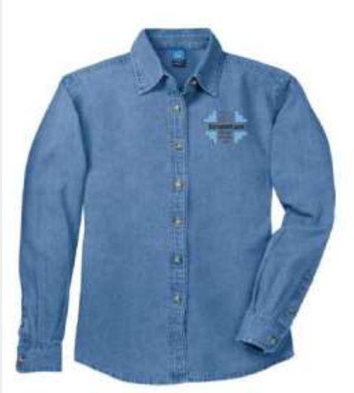
Denim Shirt SP10 LSP10